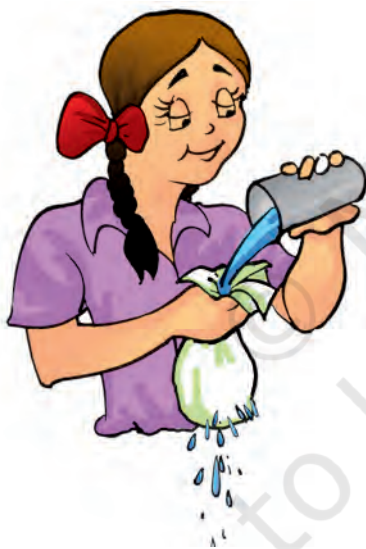
Fig. 2.2 Using a cloth tumbler

We see then, that we choose a material to make an object depending