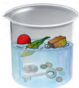
Fig. 2.6 Some objects float in water while others sink in it

drops of honey that you let fall into a glass of water. What happens to all of these?