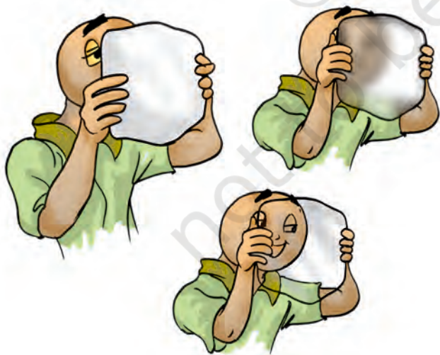
Fig. 2.7 Looking through opaque, transparent or translucent material

You might have played the game of hide and seek. Think of some places where you would like to hide so that you are not seen by others. Why did you choose those places? Would you have tried to