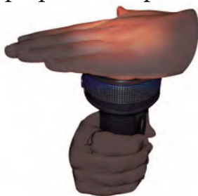
Fig. 2.9 Does torch light pass through your palm?

We can therefore group materials as opaque, transparent and translucent.