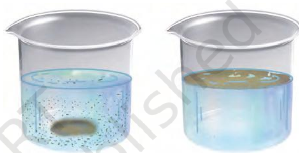
Fig. 2.4 What disappears, what doesn't?

beakers. Fill each one of them about two-thirds with water. Add a small amount (spoonful) of sugar to the first glass, salt to the second and similarly, add small amounts of the other substances into the other glasses. Stir the contents of each of them with a spoon. Wait for a few minutes. Observe what happens to the substances added to water (Fig. 2.4). Note your observations as shown in Table 2.3.