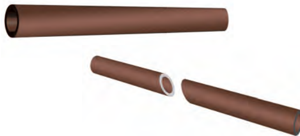
Fig. 2.3 Cutting pieces of materials to see if they have lustre

Do you notice such a shine or lustre in the other materials, cut them anyway as you can? Repeat this in the class with as many materials as possible and make a list of those with and without lustre. Instead of cutting, you can rub the surface of material with sand paper to see if it has lustre.