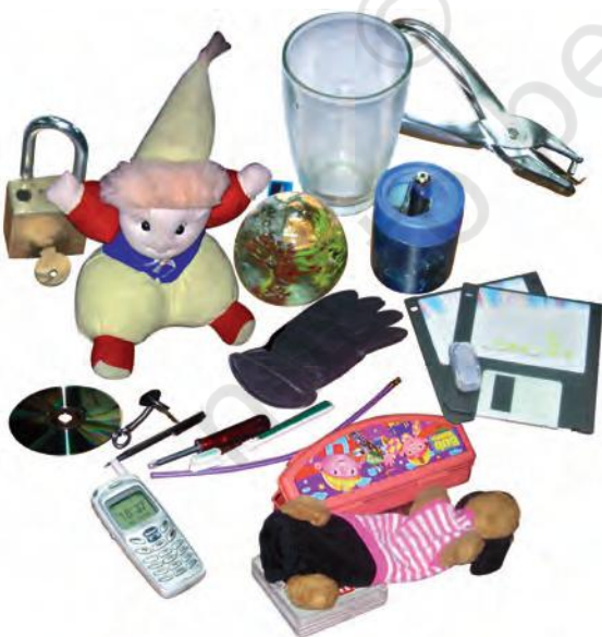
Fig. 2.1 Objects around us

Look around and identify objects that are round in shape. Our list may include a rubber ball, a football and a glass marble. If we include objects that are nearly round, our list could also include objects like apples, oranges, and an earthen pitcher ( gharha ).